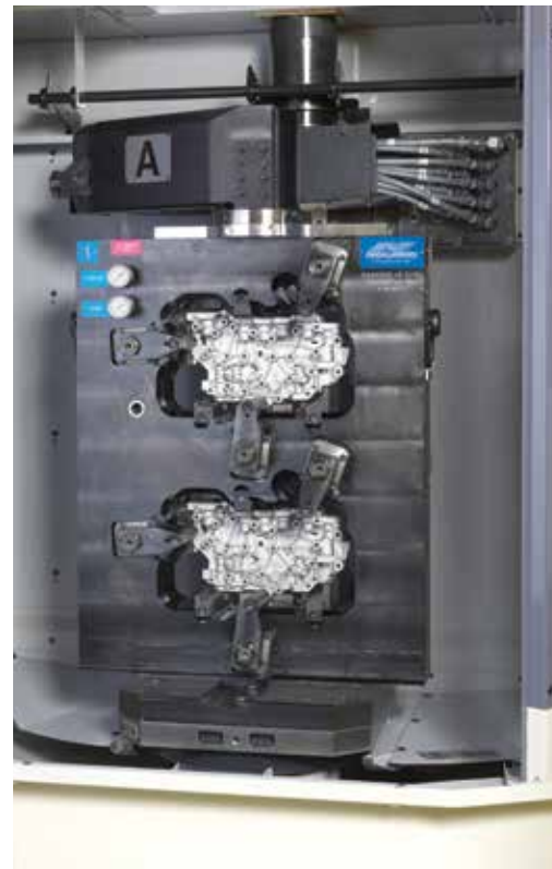
Window-style Fixtures Cut Operations Required by 50%